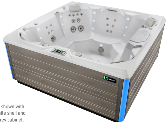
Pulse spa shown with Alpine White shell and Coastal Grey cabinet.